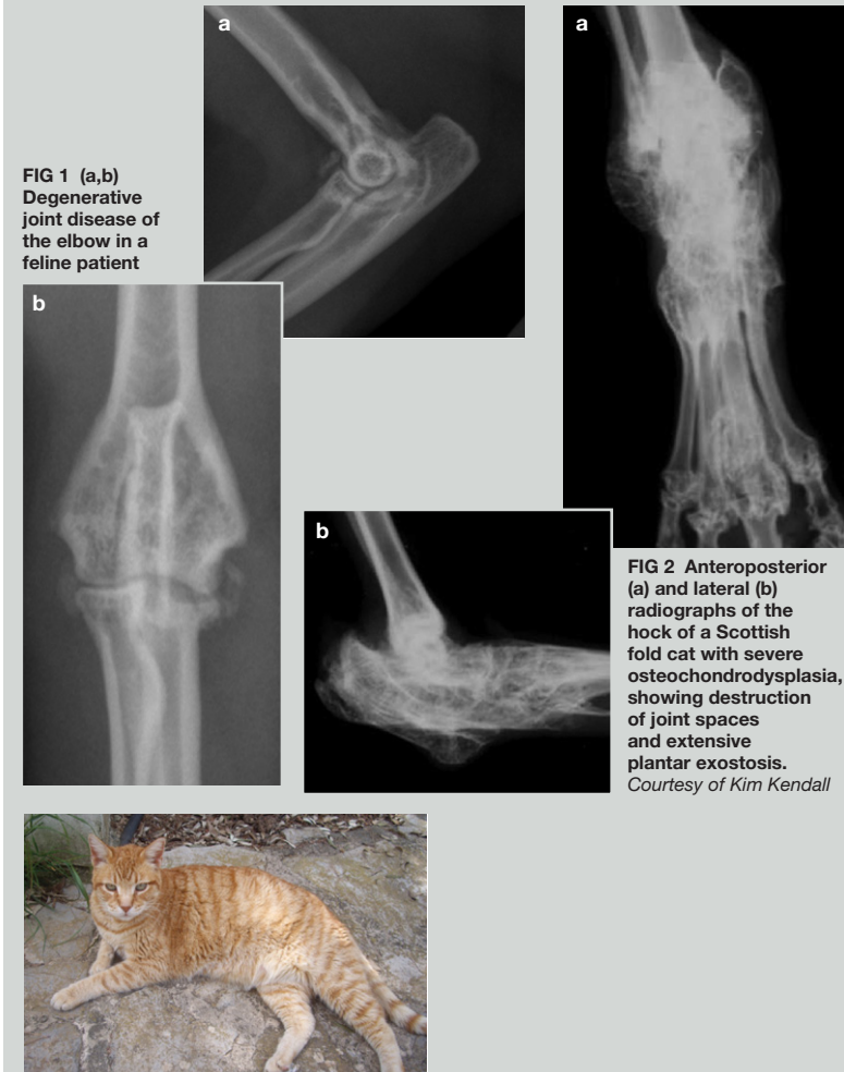
FIG 3 Watson, a DJD sufferer, enjoying the benefits of daily NSAID treatment

The most common cause of chronic feline pain is thought to be DJD, and this has been the subject of a number of important studies in the past 10 years.<sup>11,15,16,18–24</sup> From these studies, it is clear that DJD is very common, with radiographic changes affecting up to 60-90% of cats (Figs 1 and 2), ^{18,24} that it affects both the spine and the appendicular joints, and that it occurs especially commonly in older patients.<sup>18,24</sup> The hips, stifle, shoulder, elbow, tarsus and spine are the most common sites affected, although other joints can also be involved. Studies based on radiographic findings have limitations, though, as the changes observed do not necessarily correspond to clinical disease, or the severity of clinical disease and pain. Nevertheless, where