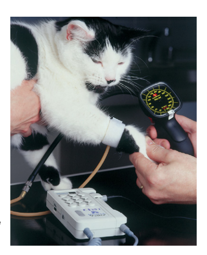
FIG 9 Blood pressure measurement should ideally be performed as a screening measure before NSAID therapy in cats

Based on appropriate use of NSAIDs in other species, the prevalence of ADEs is low in healthy patients. However, the frequency of certain ADEs increases in some patient groups, and these can therefore be classified